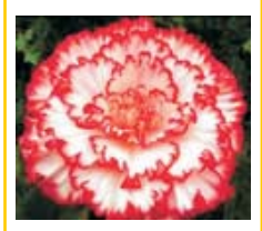
bloom on a tuberous begonia