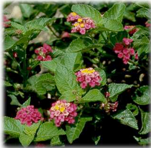
Lantana camara 'Irene'

Wild lantanas are hairy and often prickly-stemmed. If rubbed and bruised, their leaves usually have a pungent odor. Verbena-like flowers are formed in clusters from the leaf axils or at the ends of branches. The small, berry-like fruits contain seeds. In some regions, Texas included, lantanas grow wild as weeds, chiefly spread by birds that are very fond of their juicy fruits. The species name for the native L. horrida , refers to the pungent odor of the crushed leaves.